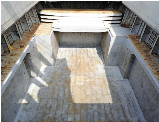
No. 1 Hold 前