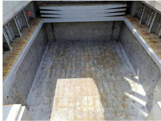
No. 1 Hold 後