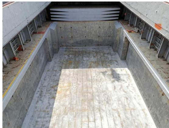
No. 2 Hold 後